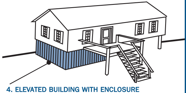
4. ELEVATED BUILDING WITH ENCLOSURE

Coverage limitations apply to the enclosed areas (lower floor) even when a building is constructed with what is sometimes called a “walkout basement.”