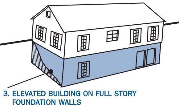
3. ELEVATED BUILDING ON FULL STORY FOUNDATION WALLS

When a building is elevated on foundation walls, coverage limitations apply to the “crawlspace” below.